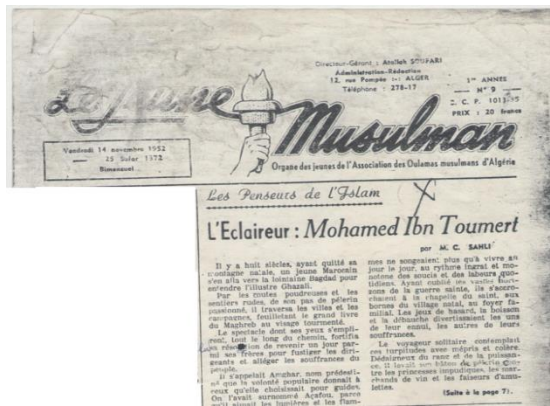
Iben Tumert d umussu ayelnaw. Wa d amagrad n Mohand Chérif Sahli (1952)