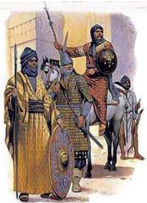
Deg useggas n1160 Imwehḥden sdukklen Tamazyā (Lmeyreb) d Landalus

Iben Tumert yura atas n yidlisen, ladya Lmurcida (Tin yettwellihen) i d-yessuffey Goldziher (Fontana, Lezzayer). Tazmamt-a n tesreḍt ahah yura-tt segmi d-yuḡal seg Usammar – D asmeskel-is adaslan amezwaru . Sebdelmumen yeqdec yef uzuzer-is deg tmezgidiwin d yiḡerbazen.