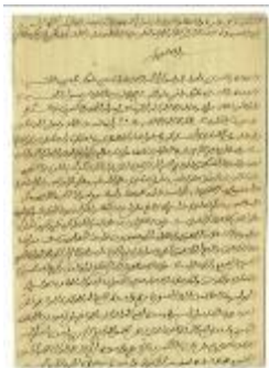
Adlis "Wadhifa" n Sidi Yeêya At Sidel