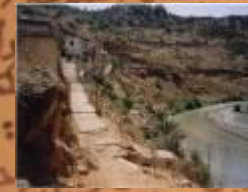
Di Lqern wis 16, tudrin ïffent amkan n temdint n Bgayet. Tamuqra tu$al d yiwet si tmezwura i d-ixelqen zzawiya ines Dagi d Lêemman n Sidi Yeêya di Tmuqra

Sharh Wadhifat Yahia al-Aydlî de Hocine al-Wartilani (1752). Copie datée de 1884.